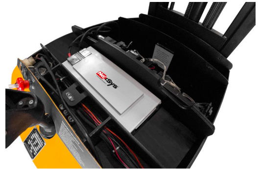
TASK ® BOA ® X-Series Model Shown