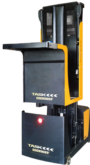
TASK ® SIDEWINDER ® Model Shown