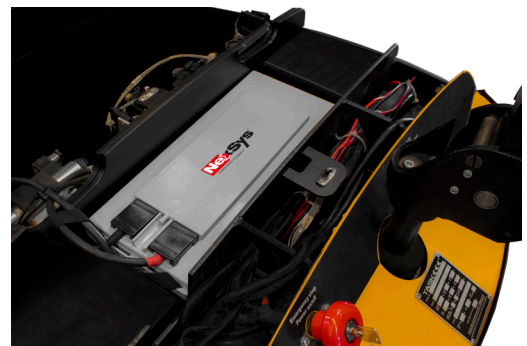
TASK ® BOA ® X-Series Model Shown